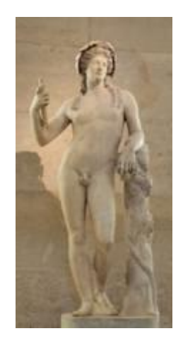
Dionysus, the god of wine

Wine was common in classical Greece and Rome. The Ancient Greeks introduced <u>vines</u> such as <u>Vitis vinifera</u> and made wine in their numerous colonies in <u>Italy</u>, <u>Sicily</u>, southern <u>France</u>, and <u>Spain</u>. <u>Dionysus</u> was the Greek god of wine and revelry, and wine was frequently referred to in the works of <u>Homer</u> and <u>Aesop</u>. Many of the major wine producing regions of Western Europe today were established by the Romans. Wine making technology improved considerably during the time of the Roman Empire. Many grape varieties and cultivation techniques were known. Barrels were developed for storing and shipping wine.