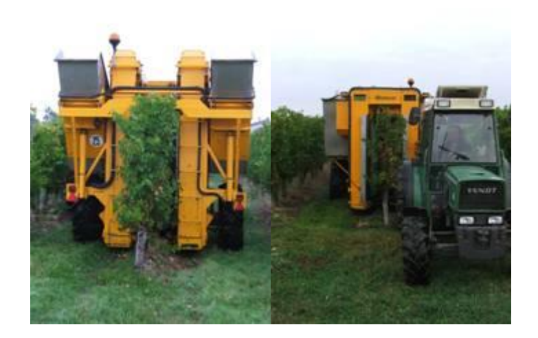
The harvesting machine

- Can you explain how this machine works?